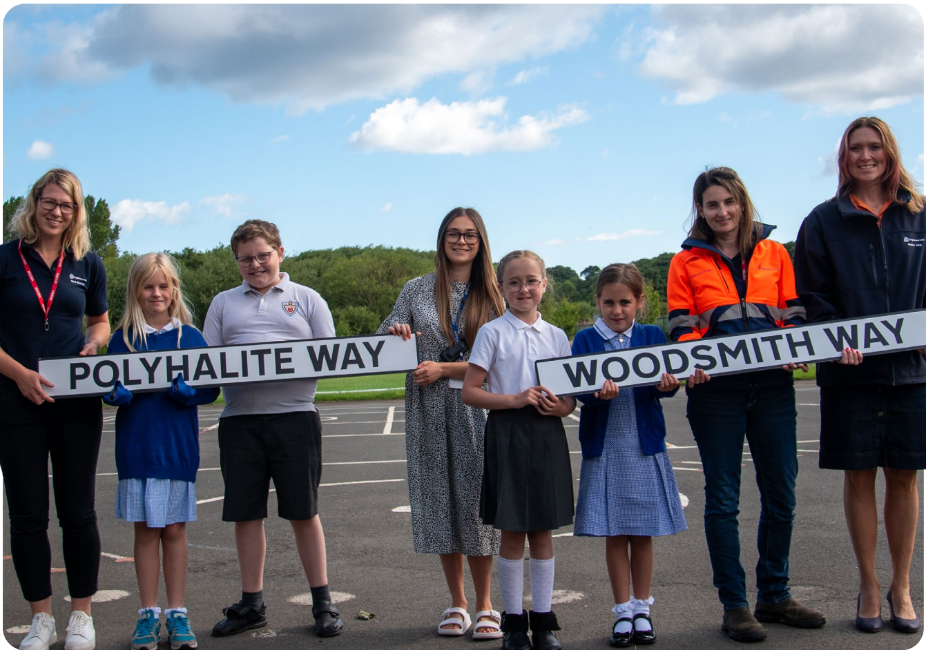
Pupils at Ruswarp School with the road signs

Pupils at Ruswarp Primary School, close to the Woodsmith Mine, were handed the responsibility of naming the roads at the site. Woodsmith Way, Polyhalite Way, Rocky Road and St Hilda’s Way were some of the chosen names.