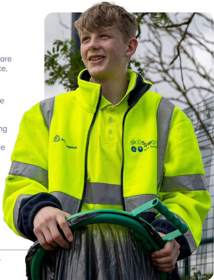
Skills4Work supporting our local community

In 2023, the Skills4Work team completed 47 projects as a result of our funding, including tree planting and a number of jobs supporting local schools, churches and sports facilities.