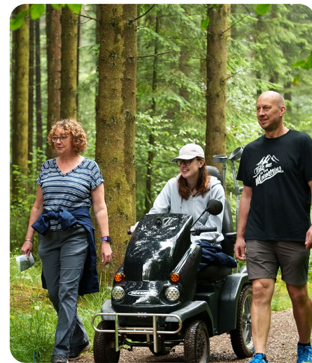
A family using tramper at Keldy Forest