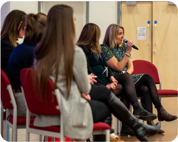
International Women’s Day panel in Redcar

To mark International Women’s Day we hosted events in Scarborough and Redcar aimed at inspiring young women from four local secondary schools. Pupils from St Peter’s College in Redcar, Outwood Academy Redcar, and George Pindar and Scalby Schools in Scarborough heard about career paths into areas such as engineering, geology, law, communications, community engagement and cyber security. One of the George Pindar School students who attended the event said: “What a cool place to work – it’s amazing it’s literally down the road from school.”