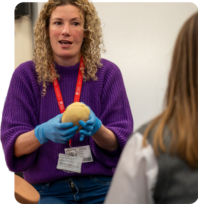
Meet the professionals session, with a midwife at George Pindar School

In 2023 we launched Achieve, our ambitious education programme that will help equip young people to achieve their potential. Achieve’s research-based, collaborative approach provides support both directly to young people, and to their schools. The young people in our Achieve group receive a range of ‘wrap-around’ support measures designed to boost their confidence, self-esteem and skills development. They are given access to regular supportive mentoring and are provided with an opportunity to take part in a range of activities, trips and visits that contribute to their personal and academic growth. Schools are also offered top-class professional support to ensure young people receive the best possible support.